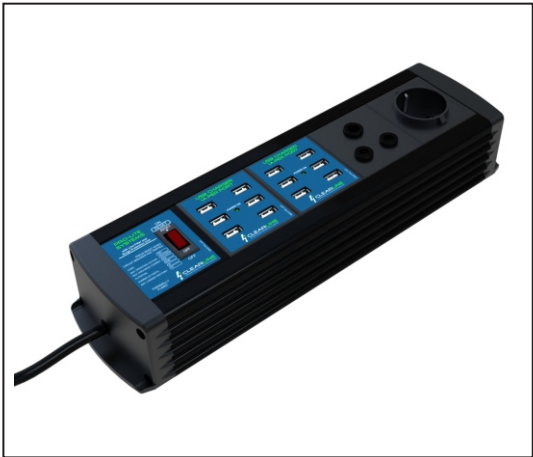
*Specifications subject to change without prior notice due to continuous improvements

This unit provides Protection for 4 AC Powered Devices. The unit will provide charging for up to 12 USB devices while also ensuring they are protected from surges. Line filtration has also been provided.