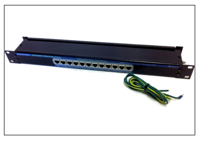
*Specifications subject to change without prior notice due to continuous improvements